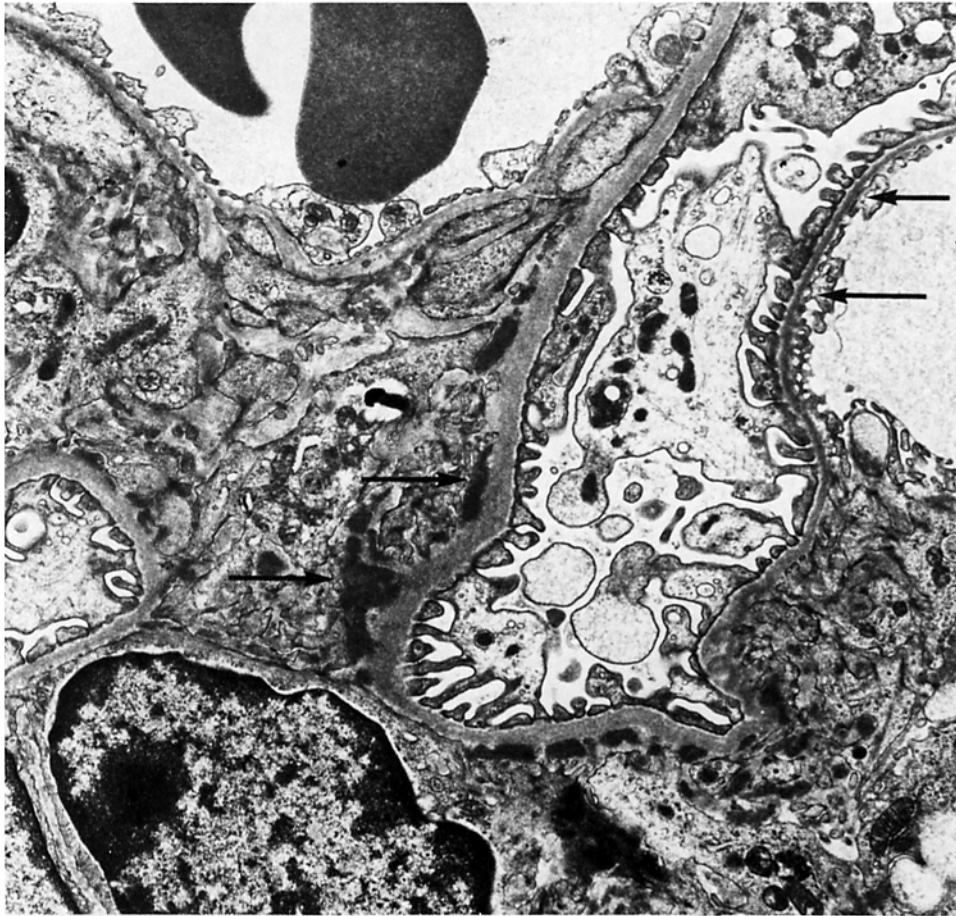
FIG. 2. Electron micrograph of a portion of a glomerulus from a mouse that had been orally immunized with OVA. Electron-dense deposits (left-hand pair of arrows) are present in the mesangium but not in peripheral capillary wall (right-hand pair of arrows). \times 8,800 .

Of six BGG-immunized mice, five revealed mesangial deposition of J chain in a pattern similar to that seen for IgA and antigen (Fig. 1C) whereas none of the six nonimmunized mice showed staining for J chain ( \chi^2 = 5.49 ; 0.01 < P < 0.02 ). All the mice had trace mesangial staining for IgM, but staining for J chain was only observed in sections which revealed IgA. No secretory component was demonstrable in the six BGG immunized mice or five nonimmunized controls examined.