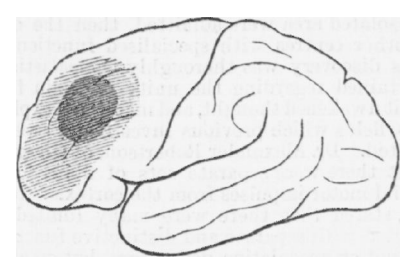
Fig. 3.-Tumour of Dura Mater pressing on Frontal Lobe.

further, besides operating in traumatic cases, trephining is justifiable in idiopathic cases."