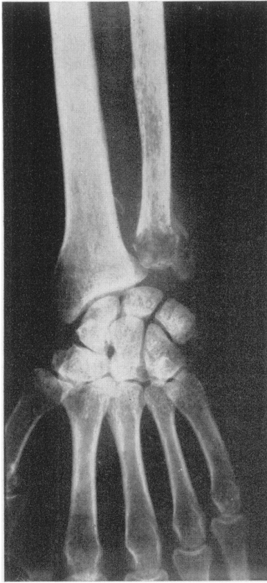
FIG. 1. Case No. 1. Osteolytic changes, distal one-third of right radius and ulna with pathologic fracture of right ulna. Blastomycosis.

tendency to bone production. There seems to be an affinity for various bony prominences; otherwise, almost any bone in the body may be affected. Encouraging results in treatment with stilbamidine and 2-hydroxystilbamidine have been reported recently although the organism does not appear to be influenced as strongly by these drugs as does the Blastomyces Dermatitidis . The central nervous system involvement is particularly resistant to treatment.