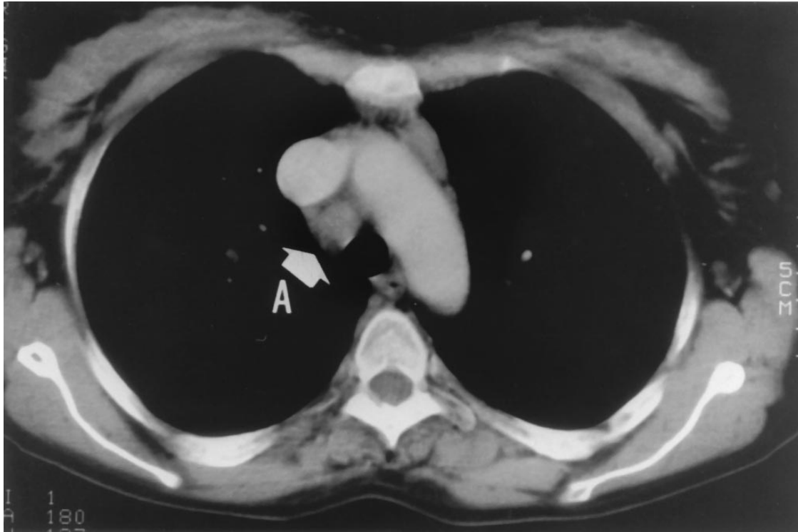
FIG. 1. Computerized tomography scan of the patient's chest showing mediastinal adenomegalies (A [arrow]).

sheep blood agar and in endothelial cells. Specific antibodies were detected against these four antigens by a microimmunofluorescence technique as previously described (6). Antibody estimations with B. henselae and Afpia felis were also performed, as previously reported (9).