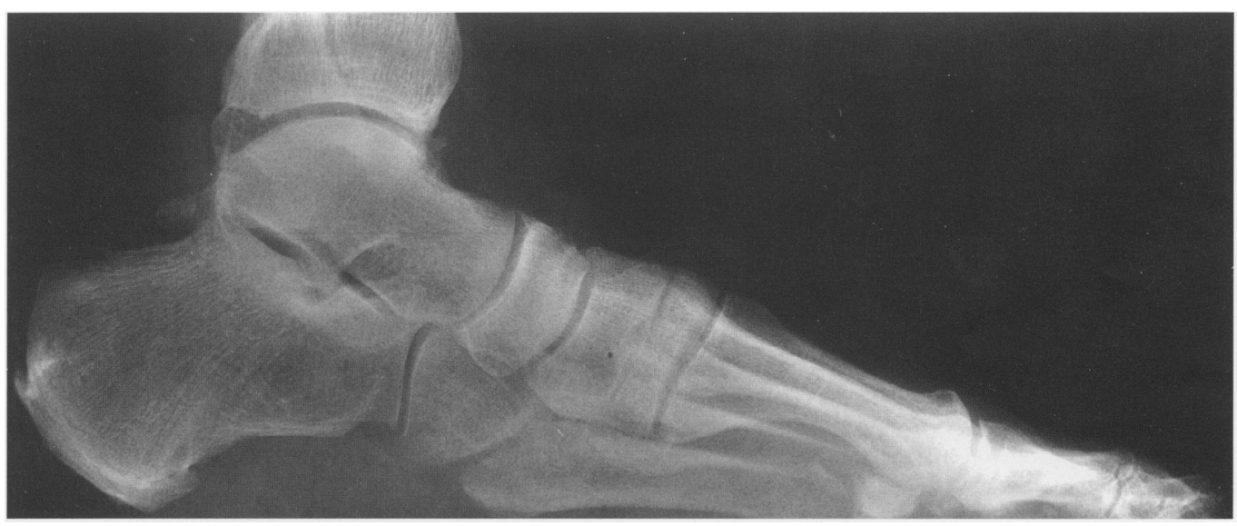
Long Term Follow-up of Medial Column Fusion and Tibialis Anterior Transposition for Adolescent Flatfoot Deformity