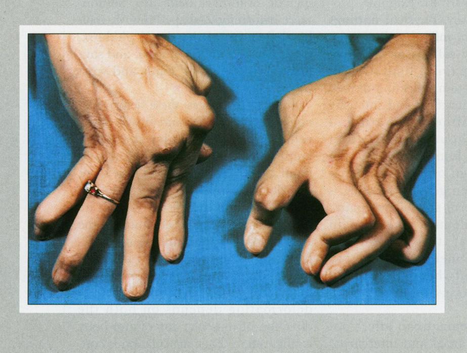
Figure 2. Rheumatoid arthritis: Hands show bilateral ulnar drift, MCP subluxation, bilateral intrinsic muscle atrophy, fixed hyperextension deformities of the right second to fourth PIPs with developing swan-neck deformity of the fourth and fifth digits, and fixed flexion deformities of the left PIPs (second to fifth), with fully developed boutonnière deformity of the left second to fifth digits.

Dorsal tenosynovitis can lead to tendon rupture, but what percentage of patients with dorsal tenosynovitis will rupture their tendons is unknown. Risk factors for this complication include continued progression of the inflammatory process despite therapy, a history of tendon rupture, and a rapidly enlarging synovial mass.<sup>6</sup> Mechanisms of tendon rupture include inflammatory infiltration within the tendon from the overlying synovial inflammatory tissue (pannus) and attrition (the sustained mechanical trauma to the tendon resulting from passing over a roughened bony surface). The ulnar styloid process and Lister's tubercle on the dorsal radius are two important bony surfaces that are eroded in the rheumatoid hand, which can lead to attrition of the overlying tendons. The result can then be tendon weakening