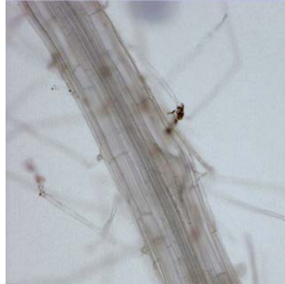
Figure S1. Bright field images of roots of hydroponically-grown wild type and oas-a1.1 mutant plants observed in Fig. 7 for UV autofluorescence of lignin deposition.