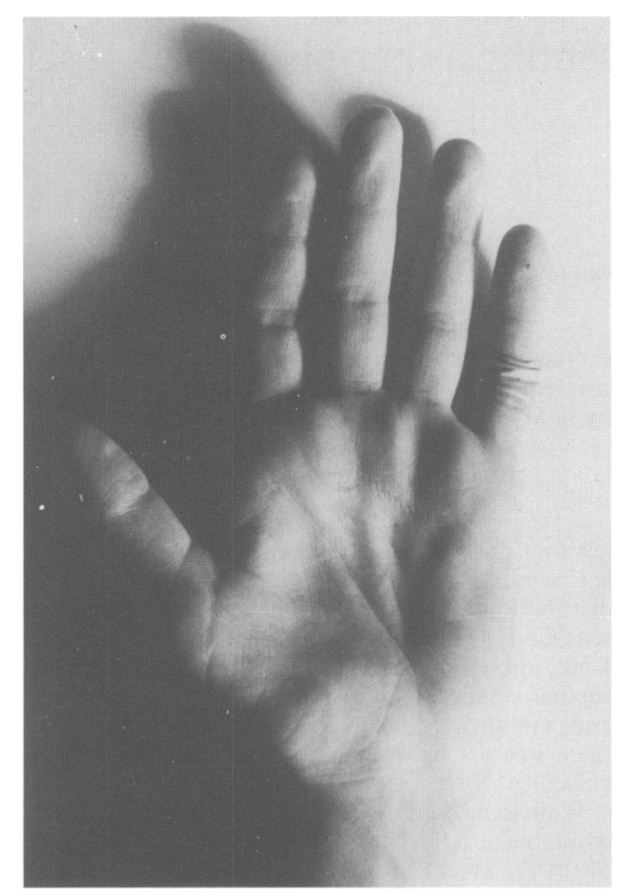
Figure 1 Photograph showing marked thenar, hypothenar and small muscle wasting in peripheral neuropathy, secondary to hypereosinophilic syndrome.

potentials were obtained on the first occasion only. The results of right ulnar nerve conduction studies are given in Table I. Autonomic function studies were performed as described by Ewing & Clarke (1982) and these indicated parasympathetic damage. Sural nerve biopsy revealed perineural fibrosis and focal myelin degeneration but no inflammatory cell infiltrate or arteritic lesions.