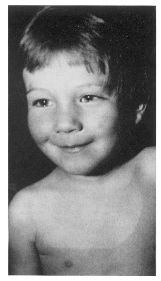
Fig. 2. After 2 months' topical treatment with clotrimazole.

clear a patient. At most it can reduce symptoms and probably also reduce the antigen load on the organism and as such is still justified. Topical use of amphotericin B and flucytosine in this disease should be restricted to supplementing the systemic use of the same drugs.