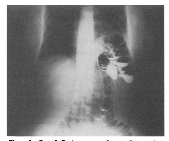
Figure 3 Case 5. Barium enema shows colon passing through the diaphragmatic defect into the left hemithorax.

Severe blunt trauma to the trunk is associated with diaphragmatic rupture in about 5% of cases.<sup>1,2</sup> The rupture may be immediately obvious (as in Case 1) or may only become apparent after an interval of a few days (Case 2). These patients frequently have other injuries, including intracranial haematomas (25%), fractures of the pelvis (25%) and long bones (50%), and injuries to intraabdominal viscera (50%) and injuries to the heart and great vessels (10%), but somewhat surprisingly, fractured ribs are not universal, with a reported