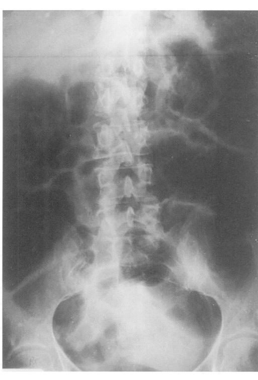
Figure X-Ray of abdomen (supine)

On examination she was apyrexial, dehydrated, and was haemodynamically stable. Abdomen was distended, there was rebound tenderness in the lower quadrants with tinkling bowel sounds. There was a leucocytosis but her urea and electrolyte levels were within normal limits. Her plain X-ray abdomen is shown in the figure.