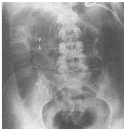
Figure 2 Radiograph demonstrating the presence of Rigler's sign (the ability to visualise both the inner and outer wall of the bowel [arrows]), following PEG insertion

abdominal pressure usually exceeds intrathoracic pressure by 20–30 cmH 2 O during both inspiration and expiration. 14 However, the association of increased intrathoracic pressure reverses this gradient and at pressures over 40 cmH 2 O interstitial emphysema results, over 50 cmH 2 O results in pneumoperitoneum and over 60 cmH 2 O creates both pneumoperitoneum and surgical emphysema. 15 The perivascular space is not the sole communication pathway between the chest and abdomen, since both pneumothorax and pneumomediastinum have been described as complications of pneumoperitoneum. Air may traverse the aortic and oesophageal hiatus or enter via congenital defects that may exist between the peritoneal and thoracic cavity 16,17 or from a pleuroperitoneal fistula. 18