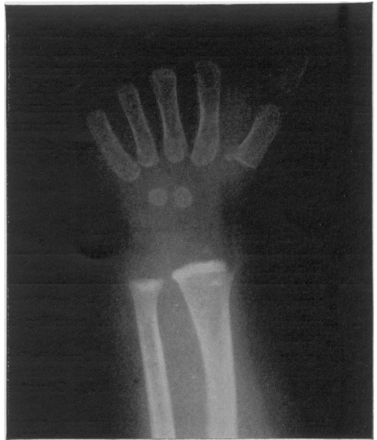
FIG. 4. Dense metaphyseal lines at the wrist of a child previously exposed to lead.

dense metaphyseal lines may be found in radiographs of the wrists or knees of children who have ingested lead (Figs. 4 and 5), it is seldom realized that these 'lead lines' are non-specific (Caffey, 1961) and may not appear until several months after exposure (Cooper, 1947). Negative skeletal radiographs do not therefore exclude the diagnosis of lead poisoning and the finding of 'lead lines' confirms only previous exposure and gives no information concerning soft tissue lead levels.