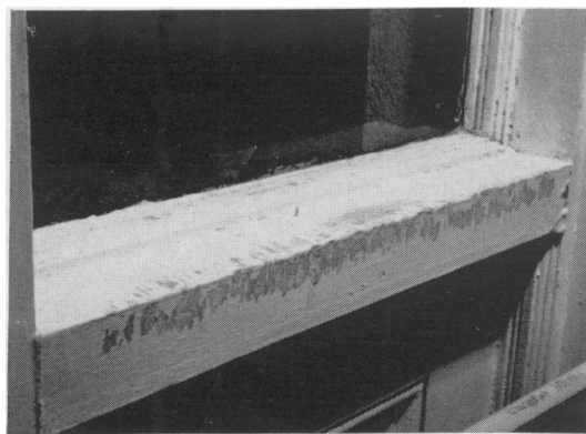
FIG. 2. Window-sill chewed by a child in an adjacent cot. Paint in deep layers contained 50% lead.

Indoor paint is responsible for 83% of the cases and in 64% of these the place of origin in the home is a window-sill or frame (Chisolm & Harrison, 1956) (Fig. 2). Other sources have included putty mixed with white lead, soil contaminated with lead (W. Orton, personal communication, 1967) and painted wall plaster.