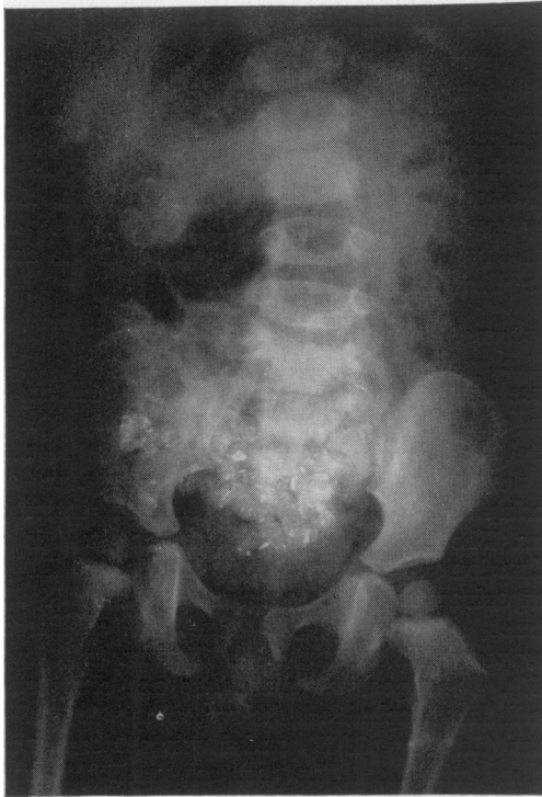
FIG. 3. Radio-opaque material in the gut of a child with pica for lead paint.