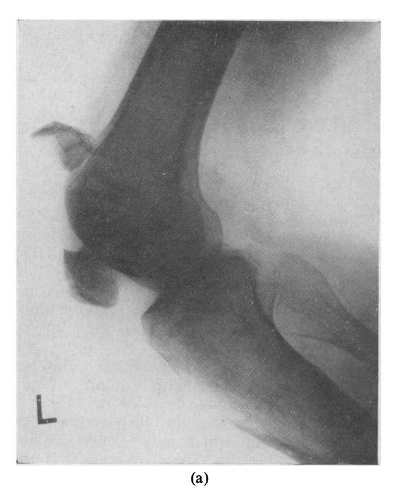
Fig. 1.—(a) Widely separated transverse fracture of the patella.

firm fixation must be achieved if the bone is to be retained, and if this is not possible, then the patella must also be excised.