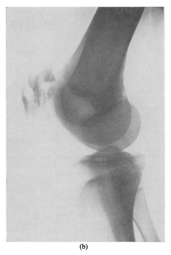
Fig. 1.—(b) Comminuted fracture of the patella.

Pain experienced under the knee-cap on going up or down stairs or rising from a sitting position, particuarly if associated with a feeling of crepitus, suggests patello-femoral osteoarthritis, and when associated with palpable crepitus and pain on moving the patella on the