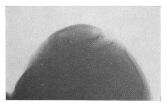
Fig. 2.—Patello-femoral osteoarthritis.