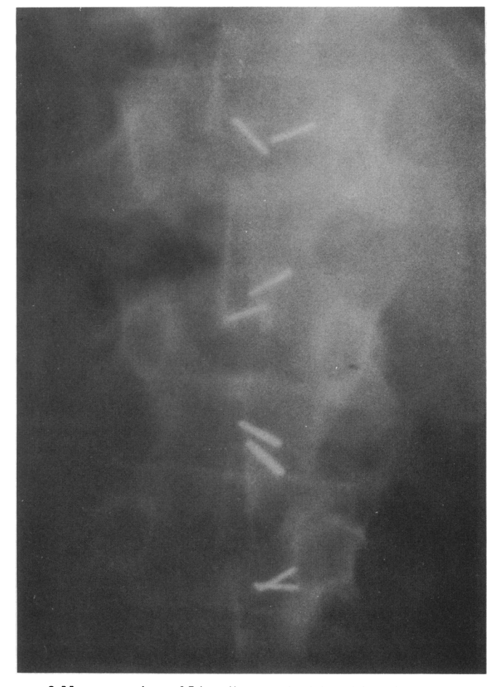
FIG. 2 No separation of Ligaclips, no incisional hernia.

The pathology of wound healing has been extensively studied, notably in San Francisco by Dunphy (7) and later by Hunt (8). Healing occurs in four stages—angiogenesis, fibroplasia, collagen synthesis and collagen maturation. When platelets are activated by thrombin they release a