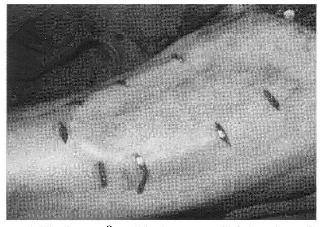
FIG. 1 The Gore-tex<sup>®</sup> graft is shown tunnelled through small incisions on the anterior aspect of the thigh, the incisions subsequently being closed with interrupted 3/0 silk sutures. Needling is carried out on the straight parts of the graft avoiding the ringed 'apex' of the loop.

end to side to the femoral vein at the site of excision of the long saphenous vein using continuous 6/0 Prolene. A subcutaneous tunnel was then created on the anterior aspect of the thigh (Fig. 1) so that the ringed part of the graft was at the apex of the loop. The other end of the graft was then cut obliquely at 45° and anastomosed end to side to the superficial femoral artery using a continuous 6/0 Prolene suture. Grafts were needled as indicated by the clinical need for dialysis, two grafts being needled within 24 h of insertion with no problems.