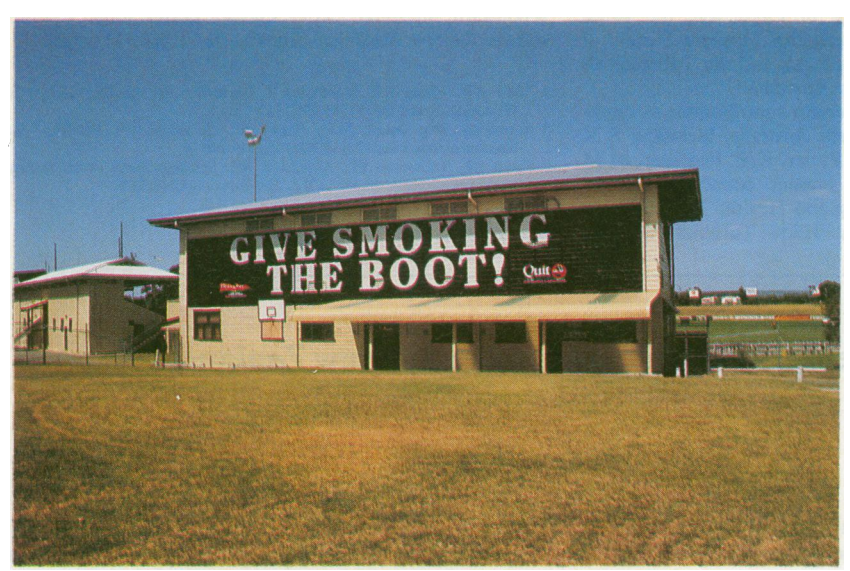
Health message replaces a billboard tobacco advertisement at a football ground

and also ensured that the health message was heard yet again.