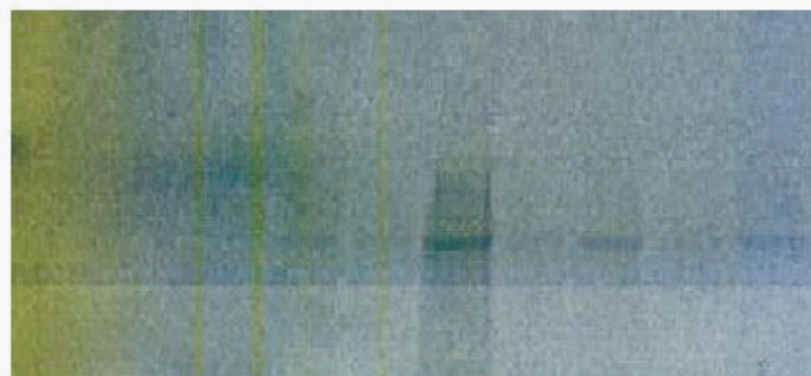
Corresponding PhosphorImager analyses (Full view)