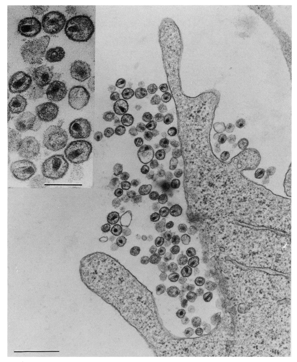
FIG. 3. Electron micrograph of an HIV-infected H9 cell, ten days post-inoculation with HIV (strain HTLV-IIIB). Typical HIV particles are seen in extracellular spaces (bar represents 0.5 \mu ). Insert shows detail of HIV particles (bar represents 0.2 \mu ).

laboratory. To arrive at an accurate identification of HIV, results obtained need to be interpreted carefully in light of the specimen, the cell system, and the methods used. Some of the neoplastic cell lines that contain endogenous retroviruses may yield mixtures of HIV and other HTLV types. Other retroviruses such as the human retrovirus associated with adult T-cell leukemia virus also show syncytia formation [44], and dual infections with human T-cell leukemia virus and HIV have been reported [45,46]. In addition, tests used commonly to identify HIV, such as the reverse