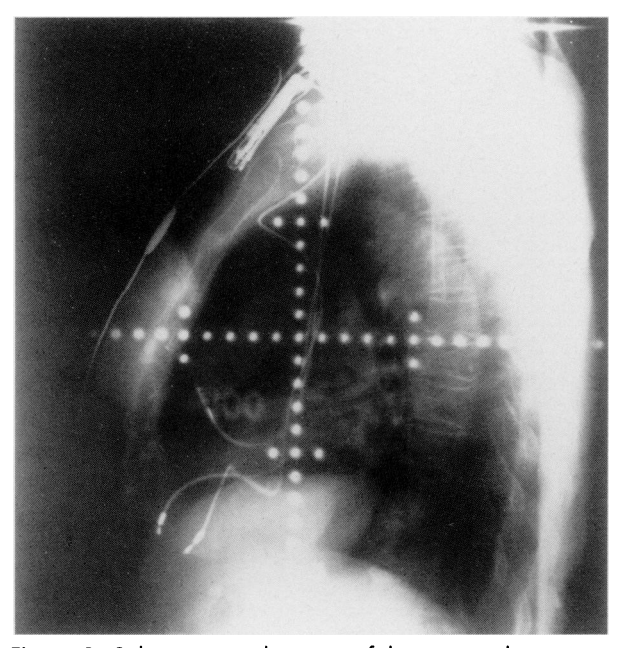
Figure 2. Subcutaneous location of the pacemaker.

placed on the patient's skin, directly above the pacemaker generator.