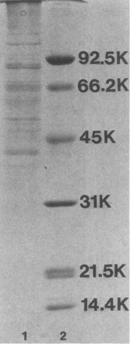
FIG. 3. SDS-PAGE of proteins from M. hyopneumoniae membranes. Lane 1, M. hyopneumoniae membranes (9 \mu g); lane 2, SDS-PAGE low-molecular-weight Bio-Rad standards as follows: phosphorylase b (92,500), bovine serum albumin (66,200), ovalbumin (45,000), carbonic anhydrase (31,000), soybean trypsin inhibitor (21,500), and lysozyme (14,400).

of 2,3,4-triphenyl tetrazolium chloride by hamster trachea organ cultures: effects of Mycoplasma pneumoniae cells and membranes. Infect. Immun. 13:84–91.