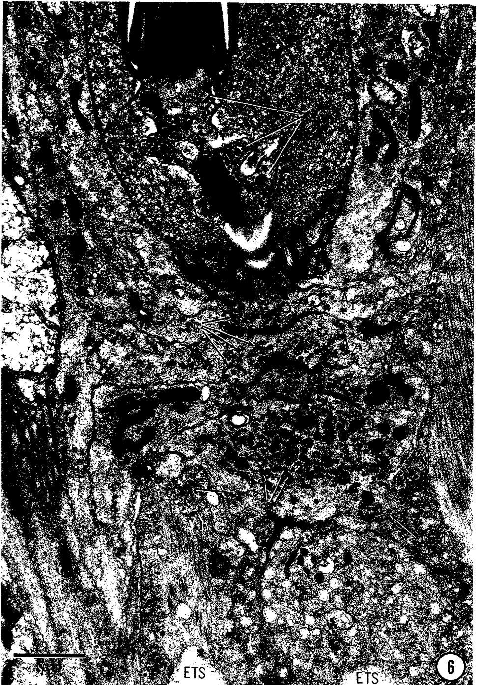
FIG. 6. Submedial section of the stylet initiation zone of J3. Arcade-like cells designated as A1, A2, A3, and A4 represent the cells that contribute to stomatal wall and stylet components. Cell A1 is related to the stomatal wall development, A2 to the flexible arm portion of the stomatal wall, A3 to the stylet cone, and A4 to the stylet shaft. These arcade-like cells can be compared to the stomatal wall and stylet components in Figures 7 and 7a. Numerous secretory granules (SG) occur in the arcade-like cells. Portions of electron-translucent vacuoles (ETS) within myoepithelial cells are separated from cell A4 by a thickened membrane (TCM). ETS = electron-translucent vacuole. PM = stylet protractor muscle. StShR = stylet shaft residue.