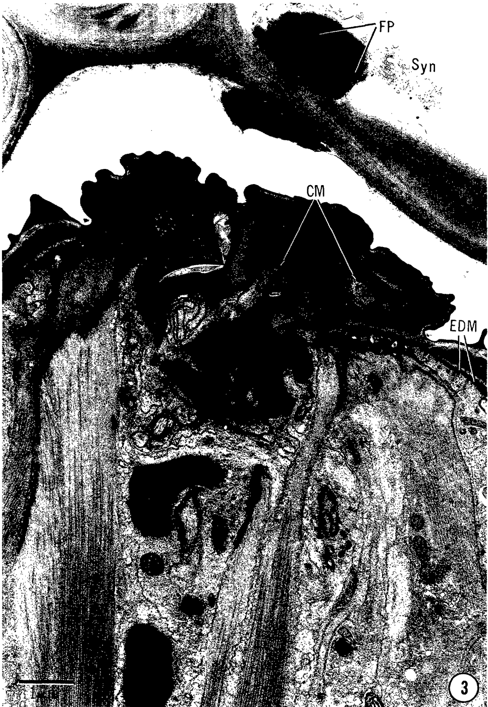
FIG. 3. Submedial section of Heterodera glycines in 'Lee' soybean roots 5 days after inoculation. Electron-dense granular material (EDM) occurs between the J2 cuticle and the J3 body. Remnants of ciliary membranes (CM) and ducts of J2 sensory organs are present throughout the granular matrix. The feeding plug (FP) deposited by the J2 shows the feeding site and the adjacent host syncytium (Syn). CW = cell wall.

← material (EDM) fills the invaginated center anterior region of the J3. Posterior to this region are arcade-like cells that contribute to development of the stoma wall and stylet. The secretion laden arcade-like cells have integrating cell junctions. StK = stylet knob of J2. StP = stylet initials of J3.