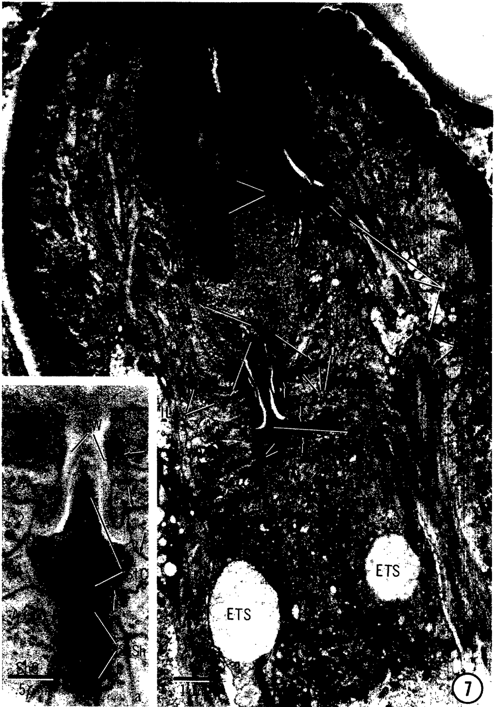
FIG. 7. Median longitudinal section of the anterior of a molting J2 showing stomatal wall and stylet initials of J3 of Heterodera glycines . Arcade-like cells A1-A4 shown in tangential sections (Fig. 6) are now shown in direct relation to the developing stages of the stomatal wall (SW), stylet cone (StC), and stylet shaft (StSh). Arrows indicate narrow membrane junctions that join the arcade cells. Just posterior to the shaft supporting cell (A4) are three myoepithelial cells, two with vacuoles (ETS) that will form the J3 stylet knobs. A third vacuole of this same nematode was shown in Figure 5a.

FIG. 7a. Stylet initial zone at a slightly different level and magnification than in Figure 7. Secretion granules, especially adjacent to the stylet cone (StC), show the direct relationship between a developing stylet and the arcade-like cell (A3). AmpCi = amphid cilia. EDM = electron-dense material. HC = hypodermal cell. ILR = inner labial receptor. ILRCi = inner labial receptor cilia. MJ = membrane junctions of amphids. ShC = shaft cell. SW = stomatal wall.