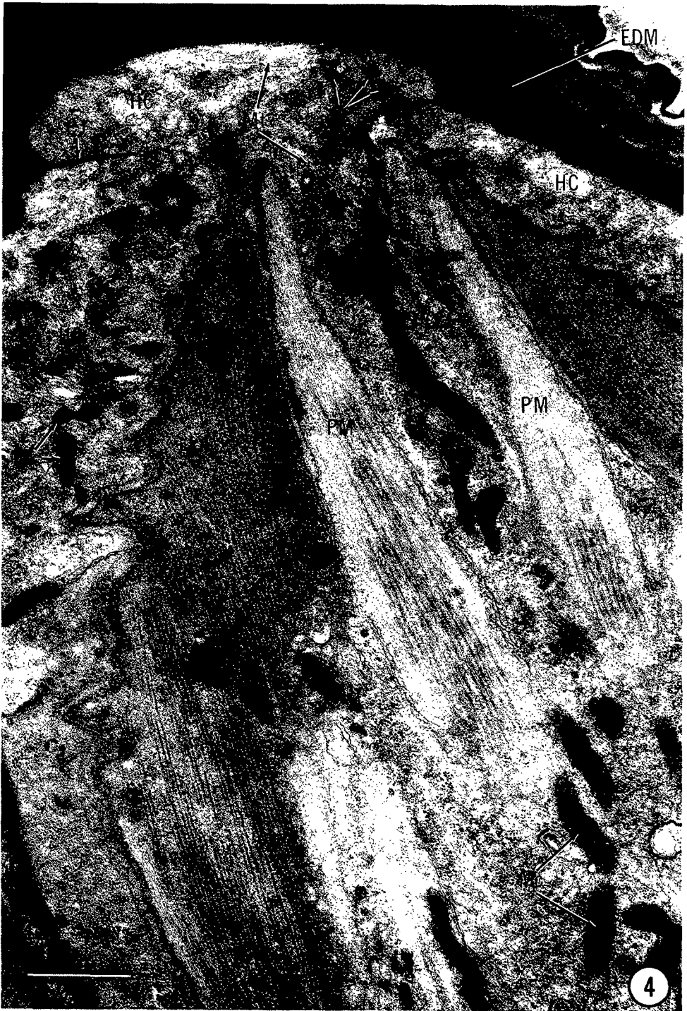
FIG. 4. Tangential longitudinal section of a Heterodera glycines juvenile 4 days after inoculation of 'Lee' soybeans. Hypodermal cells (HC) of the J3 contain microtubules (Mt), mitochondria (Mc), and secretion granules (SG). Secretion granules appear to be deposited by microectocytosis into the surrounding electron-dense material (EDM). The anteriormost cell is sharply defined by cell junctions (CJ) that separate it from the adjacent posteriad hypodermal cells. A portion of the hypodermis extends between two protractor muscles (PM), which in turn are bordered by somatic muscles (SM). Cu = J2 cuticle.