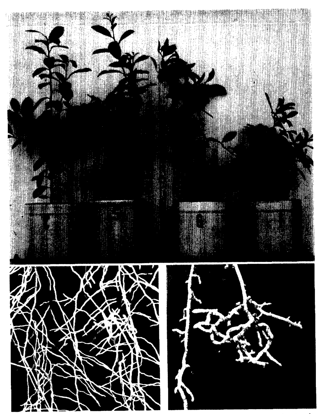
Fig. 1. Rough lemon plants and roots, healthy and inoculated with Belonolaimus longicaudatus . A. Comparison between representative plants inoculated with Sanford (S), Gainesville (G), and Fuller's Crossing (F) populations of B. longicaudatus and the non-inoculated check plants (C) fourteen months after inoculation. B. Roots of non-infested plants. C. Roots of plants inoculated with the Fuller's Crossing population.