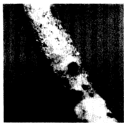
Fig. 2. Necrotic lesions on the hulls (A) and pegs (B) of peanut inoculated with the Sanford population of Belonolaimus longicaudatus .

the parasitized plants to produce new roots.