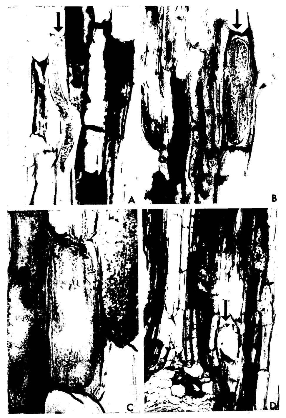
FIG. 2-(A-D). Paraffin sections of lima bean roots infected with Pratylenchus scribneri . A) Longitudinal orientation of P. scribneri to the root axis and cellular granulation 5 days after inoculation. B) Coiling of a nematode in one cell and necrosis of root cells in the area where nematode penetrated. C) Early stage of cellular response to P. scribneri indicated by presence of nuclei and slight cellular granulation; note apparent nematode breakage of cell and wall. D) Extensive cellular necrosis probably resulting from invasions of several nematodes; note nematode surrounded by necrotic tissue.