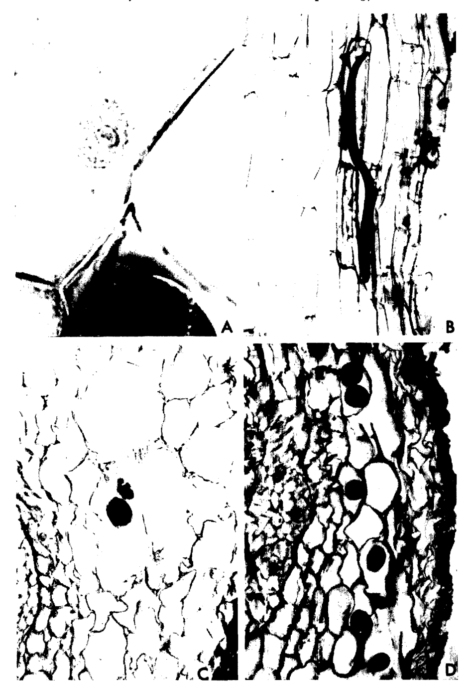
FIG. 3-(A-D). Paraffin sections of snap bean roots infected with Pratylenchus scribneri . A) Nucleus and nucleolar enlargement in cell near invading nematode. B) Only slight granulation and darkening of cells near a P. scribneri. C) Broken cell walls and cavities around the nematode. D) A later stage of infection; large number of P. scribneri present in cortical tissue with few cortical and epidermal cells remaining intact.

cell granulation and necrosis and the associated phenolic oxidation probably produced an unsuitable food base for the nematode, and/or chemical constituents