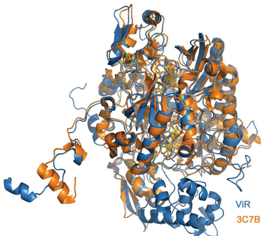
Figure S2 – Superposition of one \alpha\beta\gamma unit of D. vulgaris dSiR (DsrAB and DsrC) in blue and A. fulgidus dSiR (DsrAB, PDB code: 3C7B) in orange. The cofactors are color coded for Dvir and displayed in orange for 3C7B model.