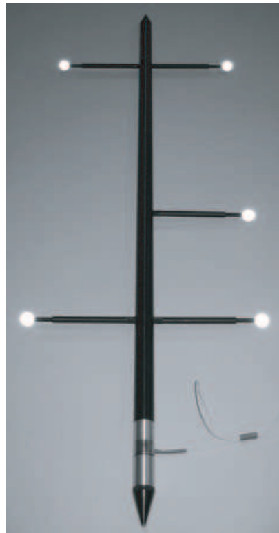
Figure 4. Photograph of the instrumented pole used for force plate calibration. The pole allows arbitrary directions and magnitudes of force to be manually applied to the force plate in arbitrary locations, using a motion capture system to record kinematics. The pole (Motion Lab Systems MTD-2) is modified to include an axial load cell (LC202-3K, OMEGA Engineering, Inc., Stamford, CT). The load cell can be seen in the foreground, in between two custom-made aluminum components (described in the following pages).