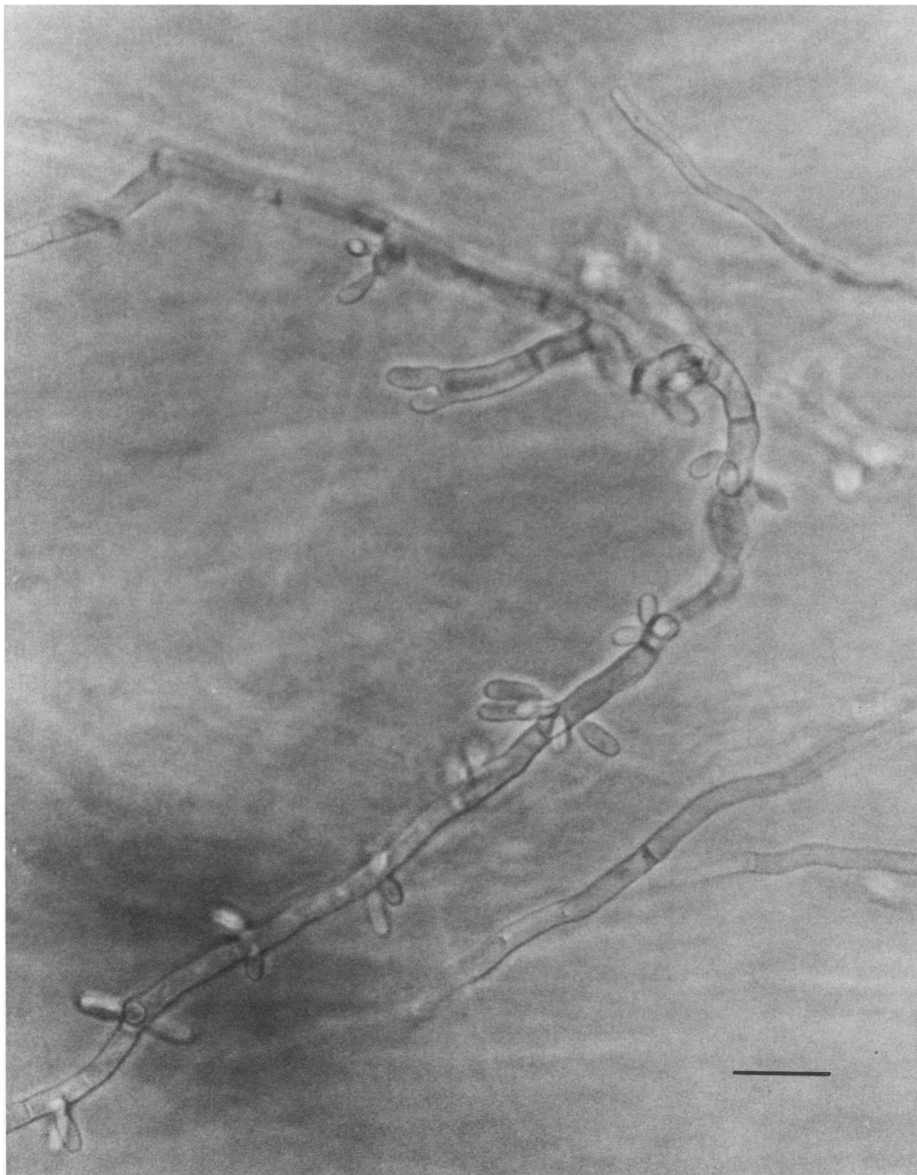
FIG. 2. Cornmeal agar slide culture of mold isolated from abscess tissue homogenate, showing blastoconidia typical of A. pullulans . Bar, 20 \mu m.