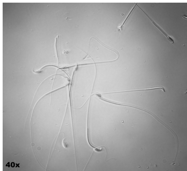
Supplemental FIG. 1, Wilkerson, et al