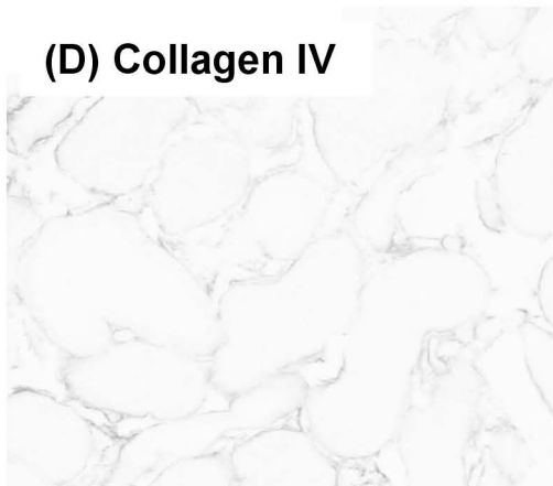
(D) Collagen IV