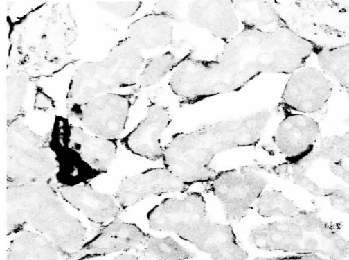
(C) \alpha -SMA