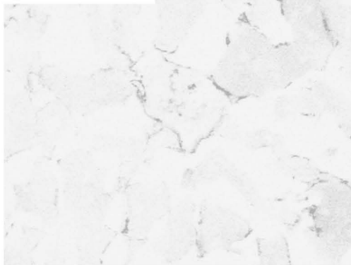
(B) \alpha -SMA