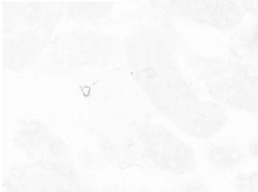
(A) \alpha -SMA