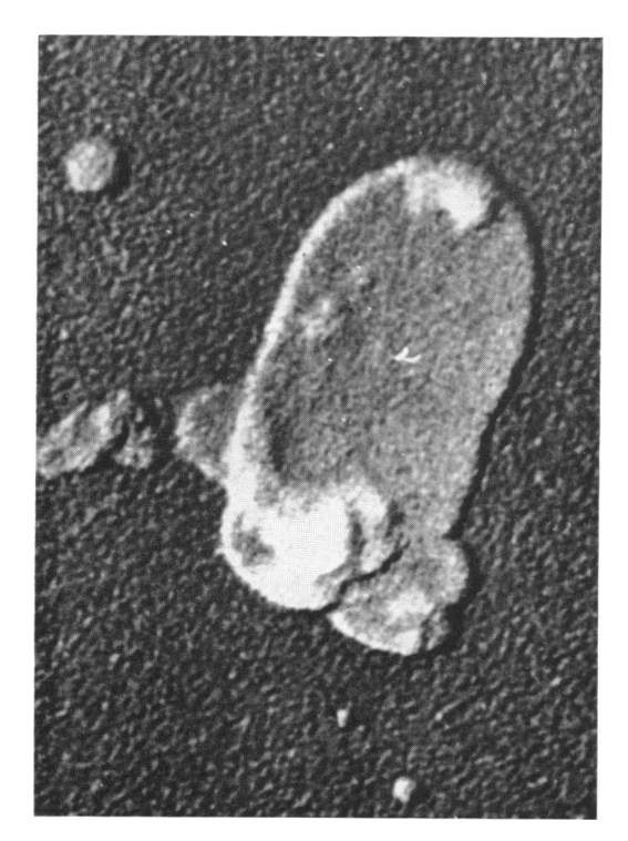
FIG. 1. Rickettsia mooseri cell wall, fixed in osmic acid and shadowed with chromium. \times 62,100.

for maximal cell wall yield were constant from experiment to experiment, and resulted in structures whose morphology did not vary greatly.