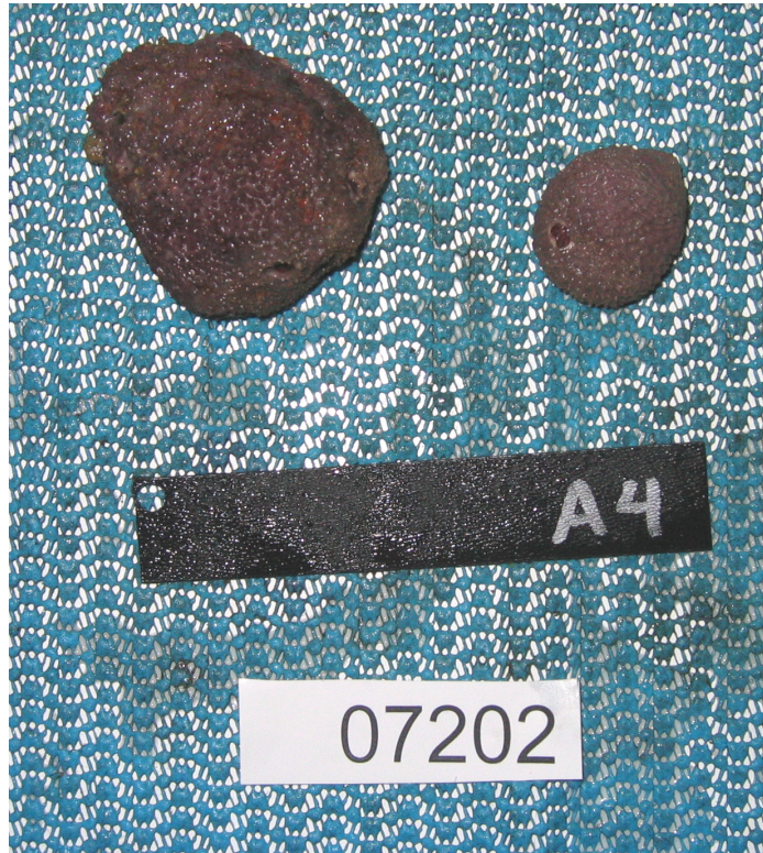
Figure S2. Photographs of 07202 and 07208