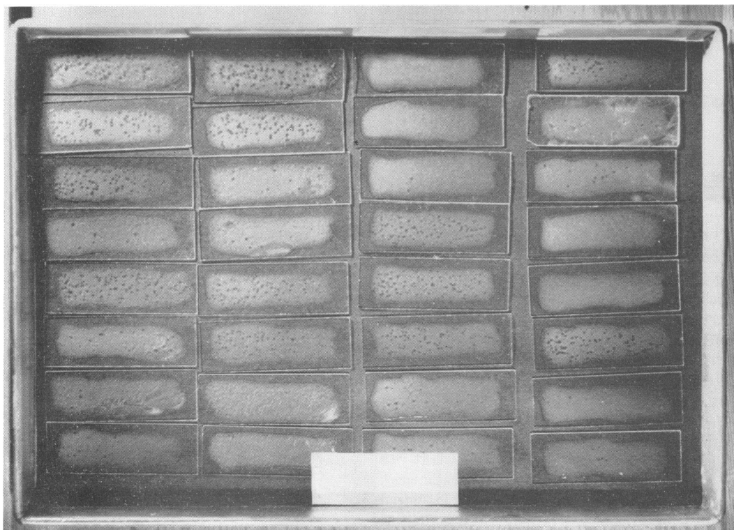
Figure 1. Tray modification of Jones-Krueger plaque count method; arrangement of slides and appearance of plaques after overnight incubation at 28 C, using Staphylococcus aureus K 1 and phage P 1 .

Generally phage assays are carried out in petri plates by the Gratia technique (Ann. inst. more reliable than the Gratia procedure with a Staphylococcus aureus K 1 -phage P 1 system.