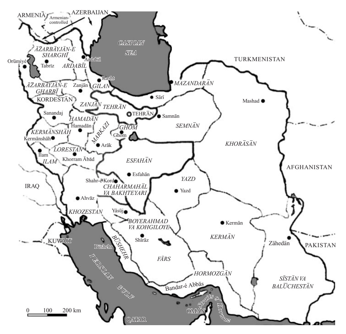
Fig. 1. Map of Iran with details of Iranian Provinces.

Schiaffino et al. demonstrated that IS200 fingerprinting is a useful tool to discriminate between clonal lines of serovar Abortusovis [9]. Application of IS200 for epidemiological purposes benefits from two characteristics: (i) presence of several copies of the IS200 element in Abortusovis, and (ii) rare transposition frequency [7, 10, 11]. Southern blot hybridization with an IS200 derived probe was previously carried out in serovar Abortusovis [9]. An IS200 band of ~ 9 kb was found in all the isolates tested from different geographic areas, and it was described as serovar-specific band. According to these results, a pair of primers that specifically amplified IS200 in serovar Abortusovis was designed [12].