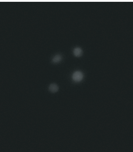
Ddc1-GFP-LacI, no array