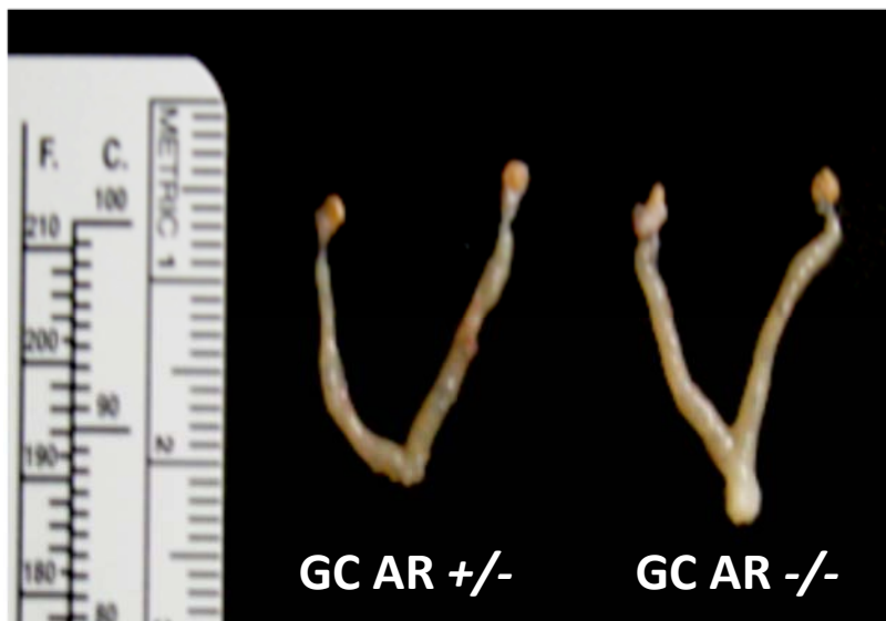
Supplemental Fig. 1