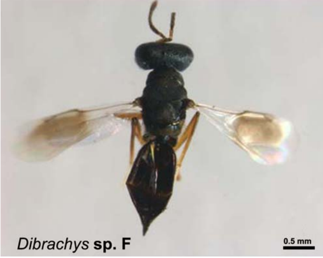
Dibrachys sp. F