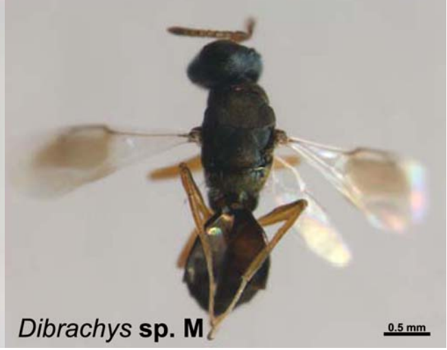
Dibrachys sp. M