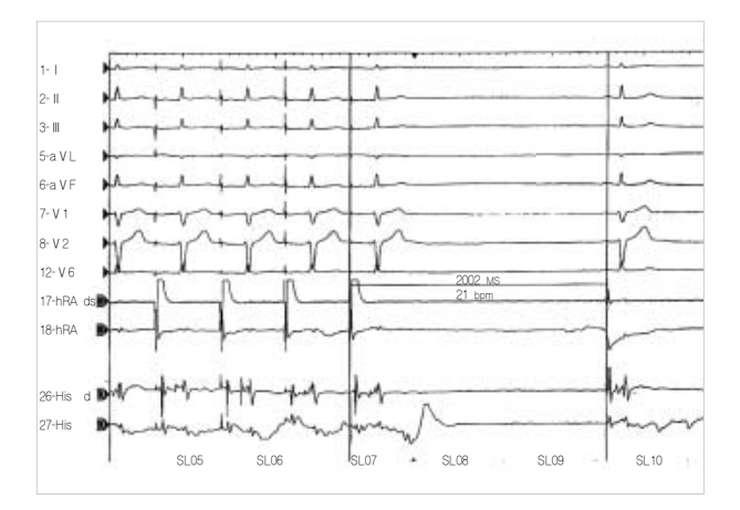
Fig. 2. Sinus node recovery time during electrophysiologic study (paper speed: 50 mm/sec). hRA: high right atrium; His: His bundle.

Bognolo et al. (5) reported a 50-yr old patient with SSS, sug-