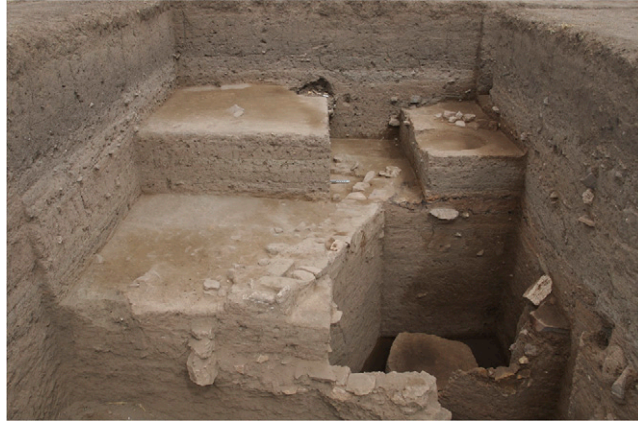
Fig. S1. Excavated unit showing distinct levels. The burn event is contemporary with the wall in the center of the unit.

Stanish and Levine 10.1073/pnas.1110176108