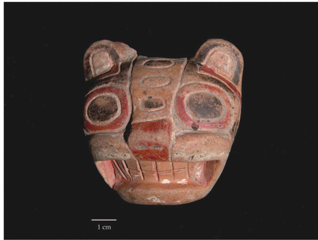
Fig. 54. Classic Pukara ceramic feline face found in situ at the base of the burn episode.