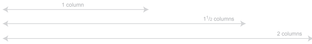
Figure Supp 1