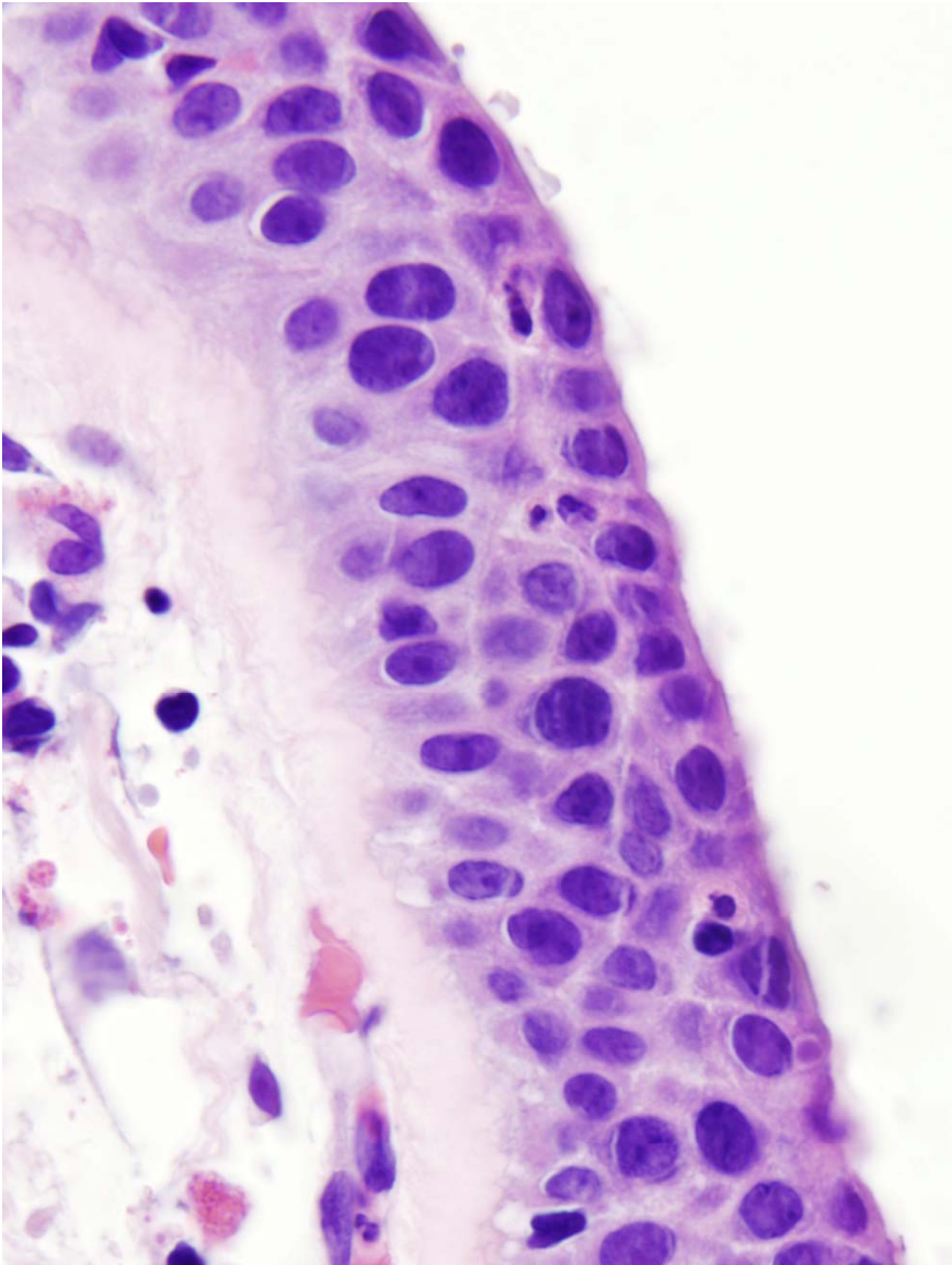
RB1/2 baseline (severe dysplasia)