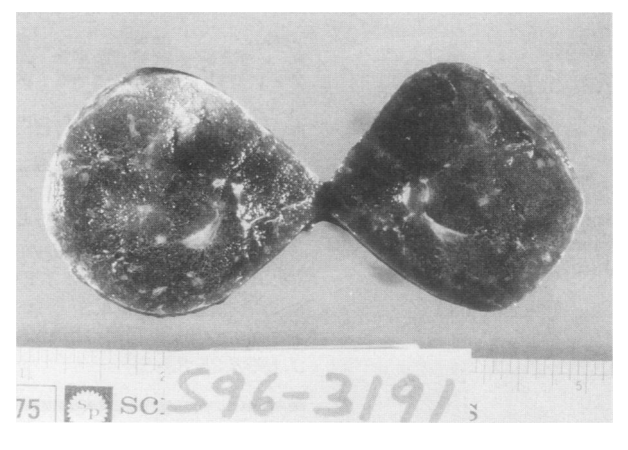
Fig. 2 This photograph of the divided specimen reveals the size, spongy quality, and well-demarcated border of the cardiac hemangioma.

1 = right ventricle; 2 = right atrium; 3 = left ventricle; 4 = left atrium; 5 = hemangioma