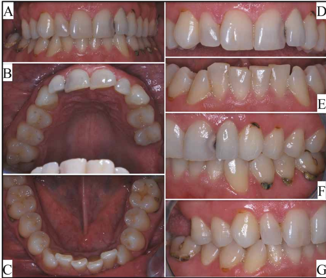
Fig. S2. Oral photographs of the unaffected father (II:4) of family 37 ( AMELX , p.P70T). A: frontal; B: maxillary occlusal; C: mandibular occlusal; D: maxillary facial; E: mandibular facial; F: left buccal; G: right buccal. The enamel shows normal thickness, texture and color, although dental caries is evident.