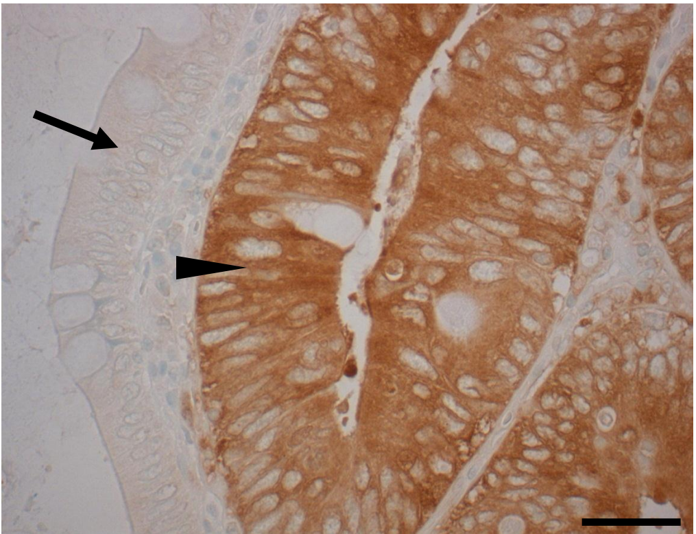
Supplementary Figure 1. Analysis of FASN expression by immunohistochemistry in tumors from colorectal cancer patients. A) A representative section showing FASN-negative colorectal cancer. B) A representative section showing FASN-positive colorectal cancer. Arrowhead indicates FASN staining in brown. Arrow indicates no FASN staining in the adjacent normal colon epithelial cells. Scale bar = 50 \mu m.