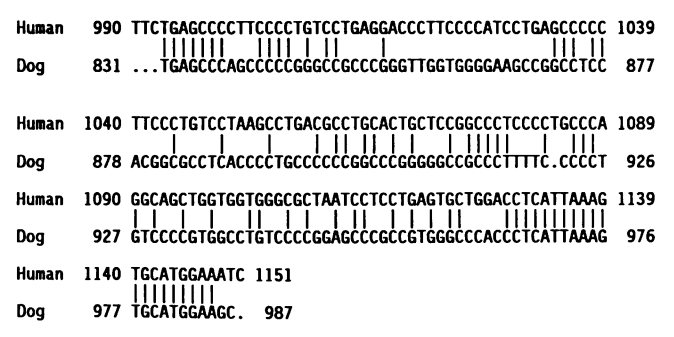
Figure 4. Comparisons of the leader amino acid and 3' nontranslated nucleotide sequences of human tryptase and dog tryptase. Identical residues are noted by a hatch mark.

of this region in the human is 162 bp and in the dog it is only 57-bp. The extensive homologies across the cDNAs of mast cell tryptase in dog and human species clearly indicate conserved characteristics.