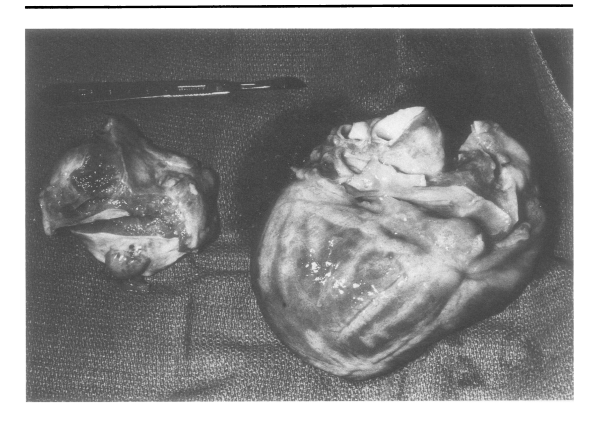
Fig. 2 Photograph showing the excised pheochromocytoma (paraganglioma) and the explanted heart.

Pathologic examination of the tumor revealed a highly vascular paraganglioma that proved to be catecholamine-producing by electron microscopy. Both thick-walled and sinusoidal vascular spaces were observed (Fig. 2).