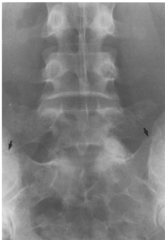
Fig. 1 Anteroposterior radiograph showing a typical lumbo-sacral transitional vertebra (LSTV) in a 47-year-old man. The transverse processes articulate with the first sacral segment bilaterally (arrows)

LSTV were defined on the basis of two criteria. First, at least one transverse process had to fuse or articulate with the first contiguous sacral segment. Second, an intervertebral disc space, even a vestigial one, had to be present caudal to the LSTV. A typical transitional vertebra meeting these criteria is shown in Fig. 1.