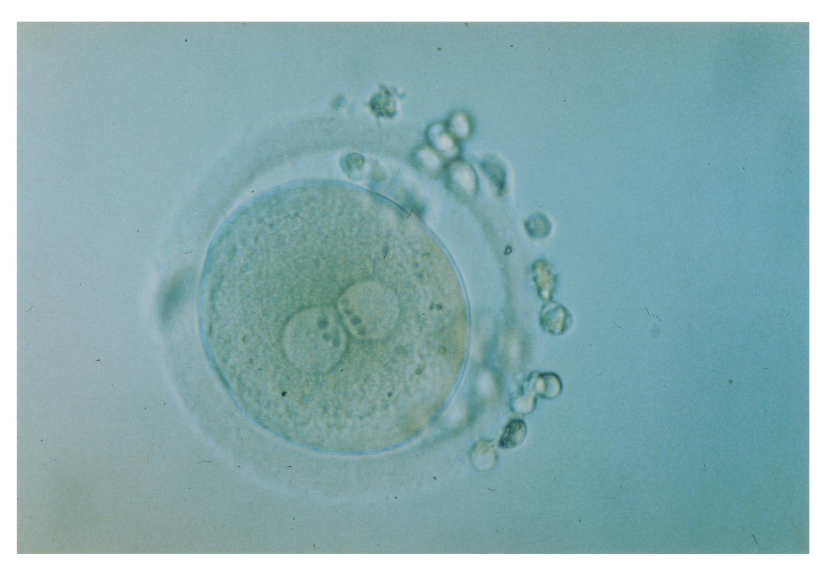
Fig. 2. Fertilized oocyte with aligned nucleoli in both PN. The small bodies are polarized on the fusion front of the PN.

rate in this group was higher in comparison to al-cycles (41.3% vs. 37.7%), but the results do not reach statistical significance. No differences were seen in the female age. By analyzing those cycles, in which al+ oocytes were selected for embryo transfer, we