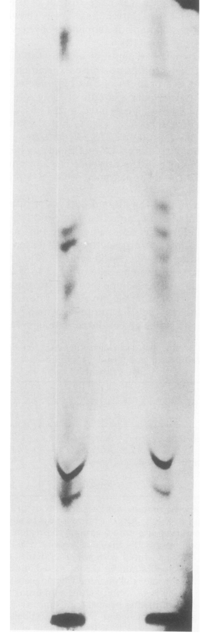
FIG. 2. Electrophoretic pattern of tryptic-digested Sindbis envelope proteins. Proteins were isolated from infected cells by the procedures described in Fig. 1 and Table 1. Preparation of the tryptic peptides from proteins eluted from gels has been published (13). Electrophoresis was at pH 3.5 for 2 h at 3.5 kV. (Left sample) Envelope proteins from glucosamine-treated cells, 29,000 counts/min added; (right sample) envelope proteins from untreated cells, 18,000 counts/min added. Site of application of the samples is at the bottom of the figure.