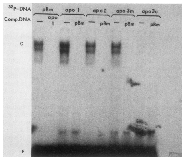
FIG. 1. Complex formation between the hydroxylapatite fraction of placental MDBP (8) and oligonucleotide duplexes containing MDBP sites in the apolipoprotein(a) gene. These 32 P-labeled duplexes, whose sequences are given in Table 1, were apo(a)1, apo(a)2, CpG-methylated apo(a)3 [apo3m], unmethylated apo(a)3 [apo3u], or pB site 1 (pBm), as a standard CpG-methylated MDBP ligand. First, MDBP was preincubated for 10 min at room temperature with 0.5 μg of poly(dI) · poly(dC) and, where indicated, with 400 fmol of a specific competitor, pBm or apo(a)1 oligonucleotide duplexes in 10 mM Tris hydrochloride (pH 7.6)–80 mM NaCl–5 mM MgCl 2 –10% glycerol–0.2 mM sodium EDTA–2 mM dithiothreitol–80 μg of bovine serum albumin per ml. Then the radiolabeled ligand (20 fmol) was added, and incubation continued for 15 min. C and F denote the closely related (21) family of MDBP-specific complexes and the free (uncomplexed) fragment, respectively.

d Determined by cutting bands from gels and quantitating Cerenkov radiation.