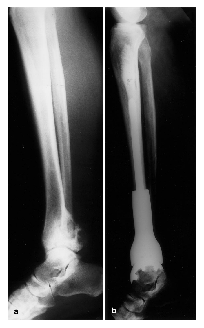
Fig. 2a,b Plain radiographs of Chondromyxoid fibroma of the distal tibia (a) treated by excision and endoprosthetic reconstruction (b) after two failed curettage procedures

was commenced at six weeks until maximum ankle and subtalar motion was achieved. All the patients achieved full unprotected weight bearing by 3 months.